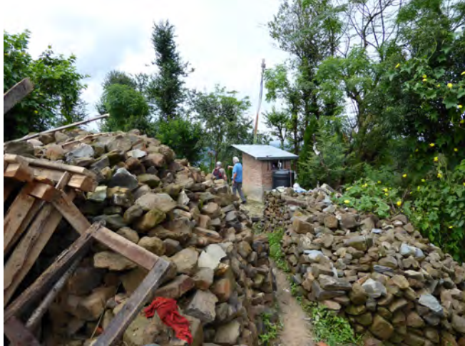
Bhattedanda villagers are still doing it tough but new works will start after the Tihar holidays