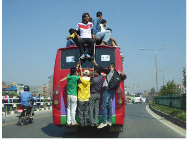
Queues for fuel, and overcrowded buses - passengers are allowed back on the roof (and other areas!) of buses during this time