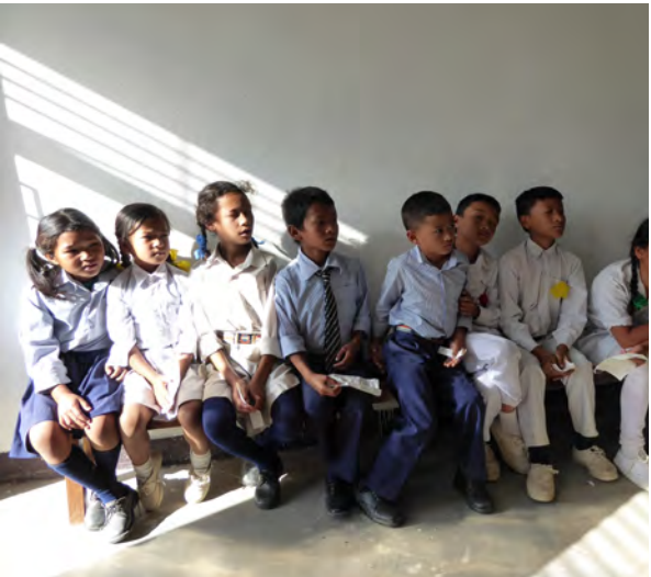
Shree Himaljyoti dental camp and kids